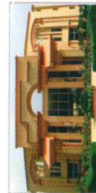
Mayoor School, Expressway, Noida