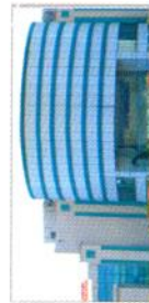
Business School of Delhi Greater Noida