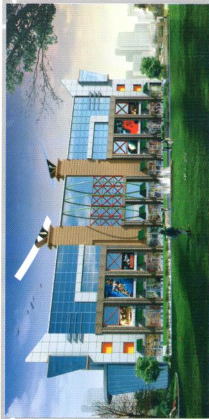
Habitech Crystal (Project Nearing Completion), KP - 3, Greater Noida

Our mission at Habitech Infrastructure Ltd. is to work under necessities such as, Strategic Location, Stylish Design, Convenience, Class with Vastu, Idyllic Surroundings and affordable rates with strict observance to the legal aspects.