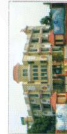
Grand Heritage Resort City Park, Greater Noida